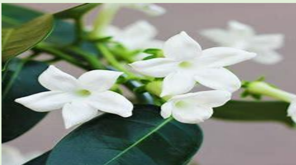
Fig. 2: Jasmine